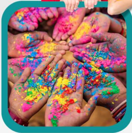
Art & Craft